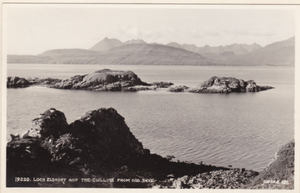
1920. LOCH EISHORT AND THE CUILLINS FROM ORD SHYE.

From Torrion to Elgol the road runs along the Strathaird Peninsula (in the middle distance of picture) below Beinn Meabost (1128 ft). In the background the Black Cuillin can be seen, and the ridge of Blaven to the far right