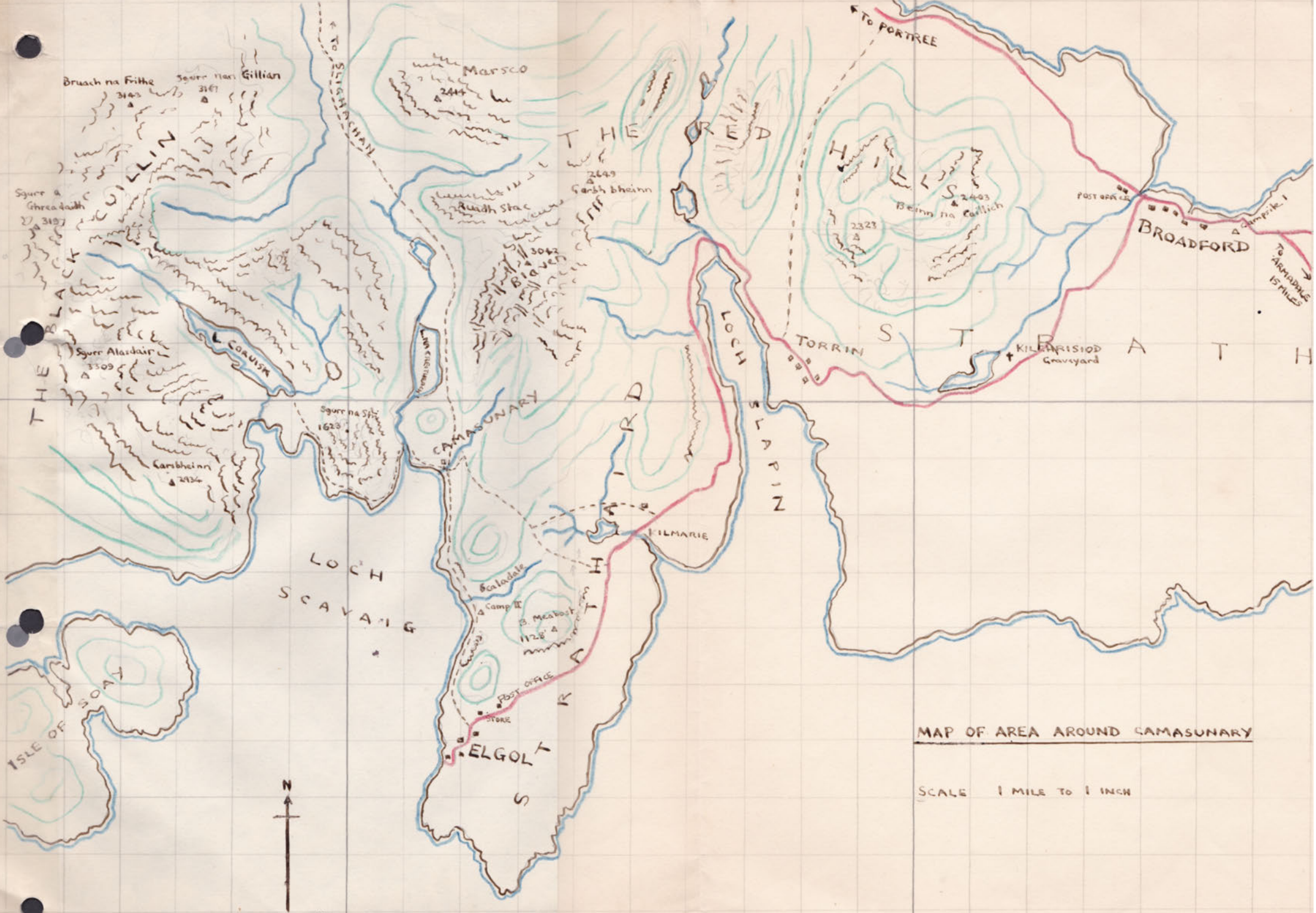
MAP OF AREA AROUND CAMASUNARY