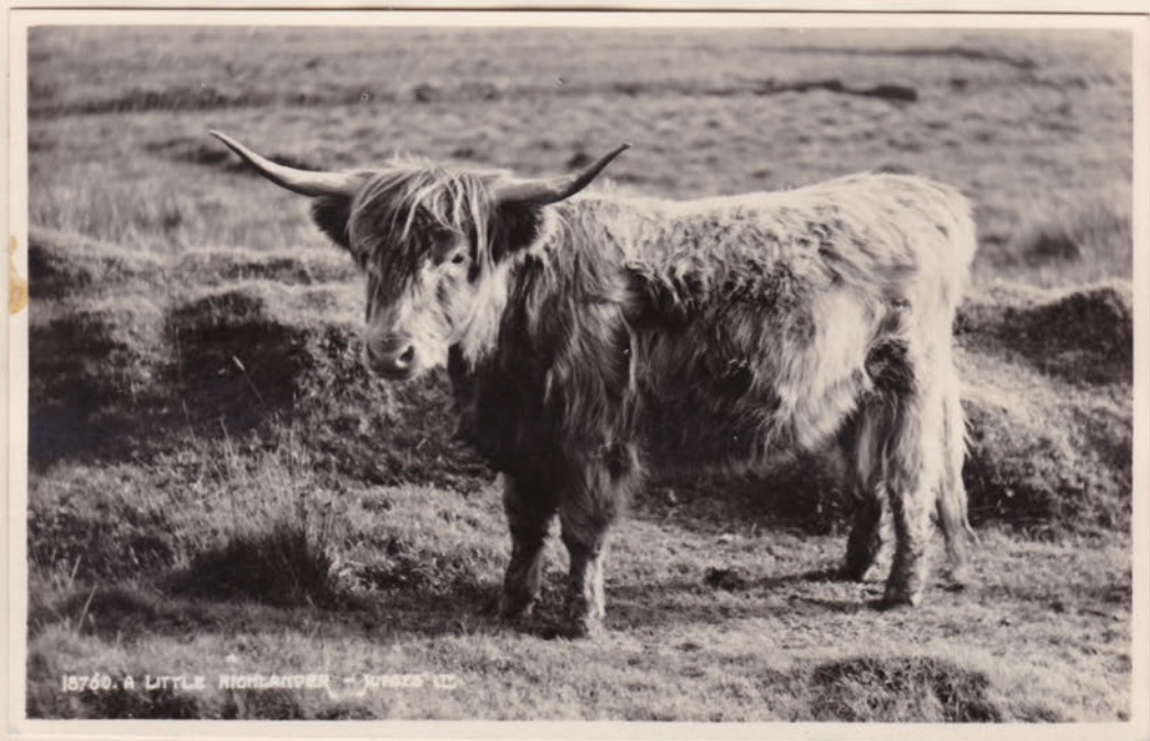
One of the island's traffic hazards.