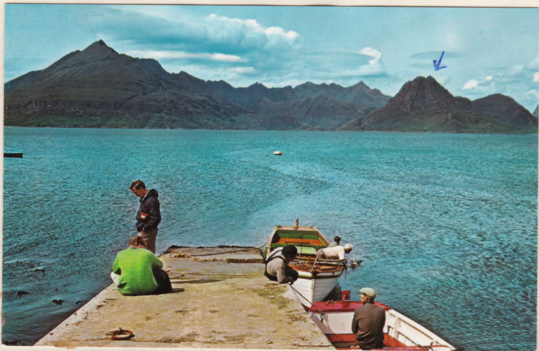
From Elgol, a view into the Cuillin. Sgurr na Stri (1623 ft) marked with an arrow is on the left of the Camasunary valley, just visible on the far right. Boats leave this jetty for Loch Coruisk