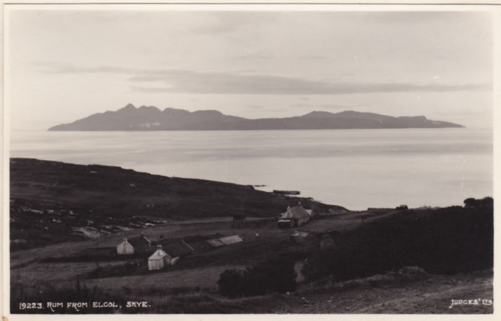
1923. RUM FROM ELGOL, SKYE.

Visible from the campsite (usually) was the Island of Rhum, and Eigg, one of its satellites. The wind was generally such that we could forecast immediate weather changes by seeing what was coming across from Rhum.