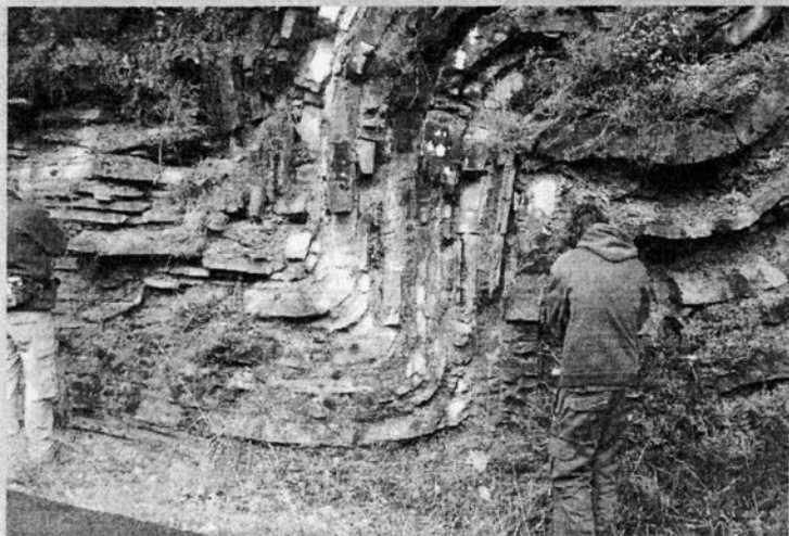
A Spanish student tempted by geology?

U6th Geologists, with three interpreters and their minder from the Spanish Department, set off on a stormy Sunday during half term to catch the ferry from Plymouth to Santander. The voyage was eventful; passengers were banned from going up on deck, waves crashed over the windows on the upper decks, a foul "fish lorry" aroma pulsed up the lift shaft from the car decks, and at least two members of the party felt that death was preferable to life at sea.