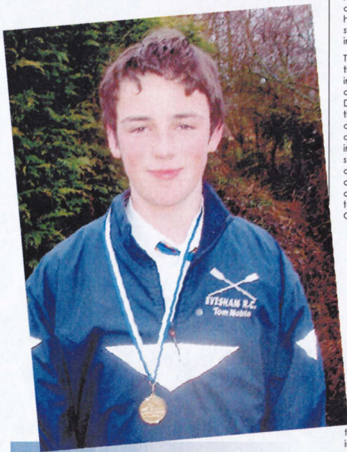
Sir Thomas Rich's, Oakleaze, Longlevens, Gloucester, GL2 0LF. 01452 338400

The same quad achieved fifth place out of a field of 32 at the National Schools Head at Henley at the beginning of March.