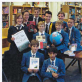
NEARLY NEW UNIFORM

2007/08 school year starts for pupils, 8:40 am