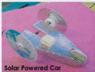
Solar Powered Car