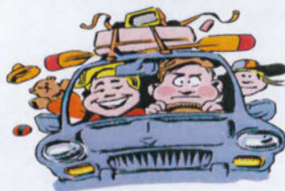
Car Boot News