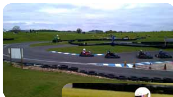
Toby Hogg defends second place