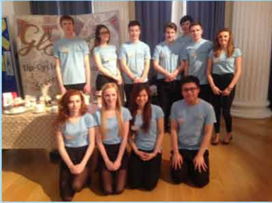
Team of 16