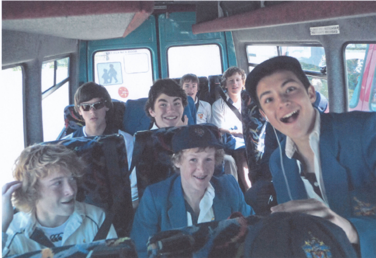
The U14s glad to arrive on 'terra firma' - they posted one of the most successful cricketing tours to date by an STRS U14 side