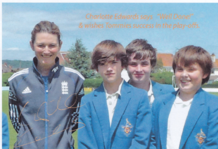
Charlotte Edwards says "Well Done!" & wishes Tommies success in the play-offs.