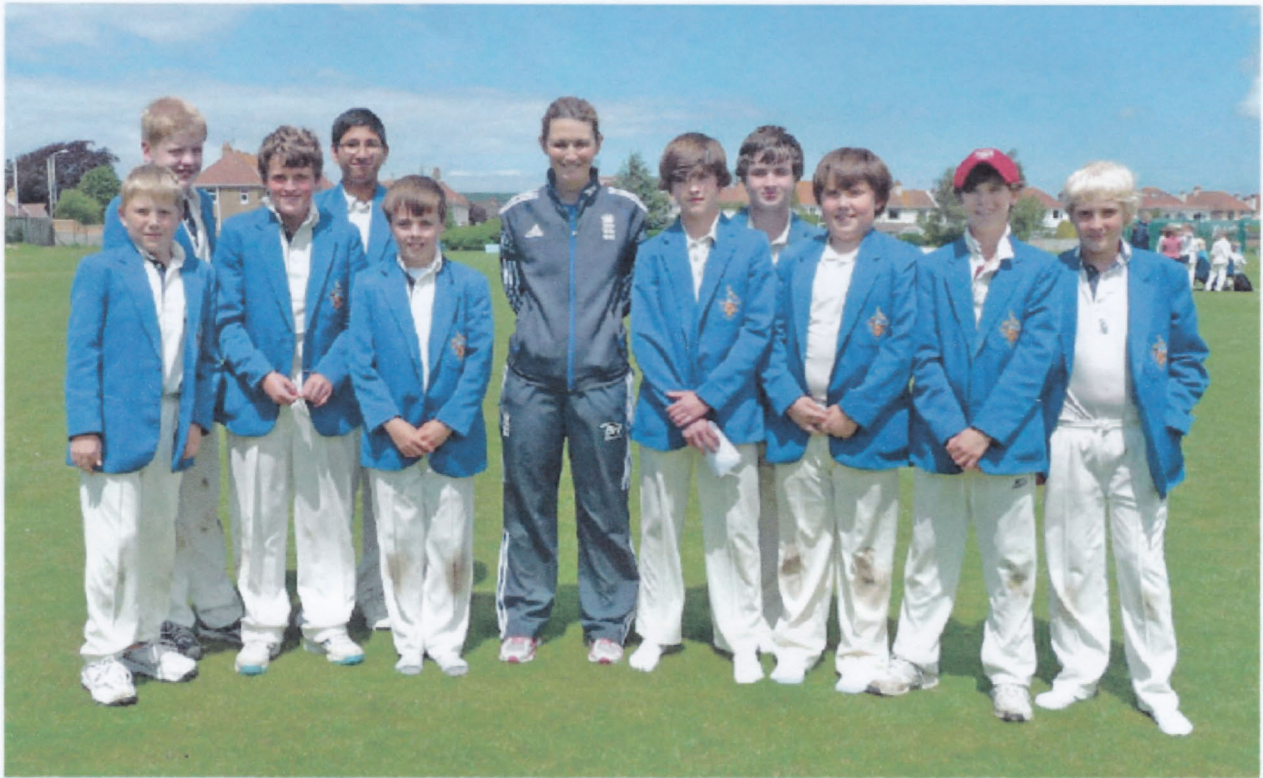
U13 Squad - ‘Chance to Compete’ Southwest Winners 2012 with Charlotte Edwards, Captain of England Ladies’ Cricket Team

The U13s were given an unexpected opportunity to compete in the 2012 regional finals of this new Eight-a-side national cricket competition. The competition is part of the Cricket Foundation’s ‘Chance to Shine’ initiative to bring back competitive cricket as a mainstream sport in state schools up and down the UK and to encourage the involvement of clubs in the education of young boys and girls via the sport of cricket.