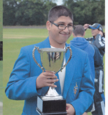
Chance to Compete Eight-a-Side National Champions